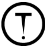
D2A - Very Toxic