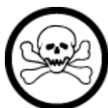
D1A - Very Toxic

D2B - Poisonous and infectious material - Other effects - Toxic