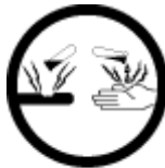
E – Corrosive