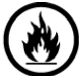
B3 – Combustible Liquid

WHMIS Classification: B3: Flammable and combustible material – Combustible liquid